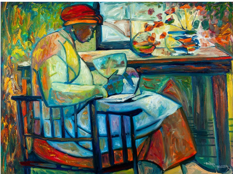
Profile Portrait of a Woman reading a Bible William Tolliver

"Whether persons are single or married, gay or straight, bisexual or ambiguously gendered, old or young, abled or challenged in the ordinary forms of sexual expression, they have claims to respect from the Christian community as well as the wider society. These are claims to freedom from unjust harm, equal protection under the law, an equitable share in the goods and services available to others, and freedom of choice in their sexual lives—within the limits of not harming or infringing on the just claims of the concrete realities of others. Whatever the sexual status of persons, their need for incorporation into the community, for psychic security and basic well-being, make the same claims for social cooperation among us as do those of us all. This is why I call the final norm 'social justice.' If our loves for one another are to be just, then this norm obligates us all."